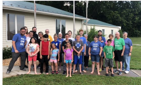
Thank you to Greenbrier Baptist Church for hosting the missionaries as they helped Hagerstown Church

Big shoutout to the youth group at Covenant Church in Shepherdstown, WV for labeling all our water bottles. This was a huge help to us! Without your help, our fireworks outreach would not have been as successful as it was. Thank you Covenant Church!