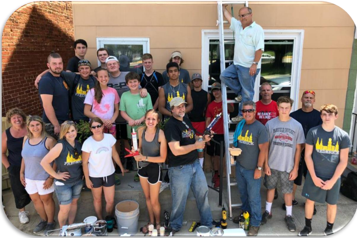
LakeView Church doing ministry at a local home within the community.