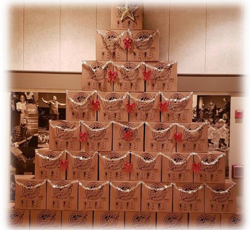
Covenant Church – 20,676 shoeboxes Operation Christmas Child