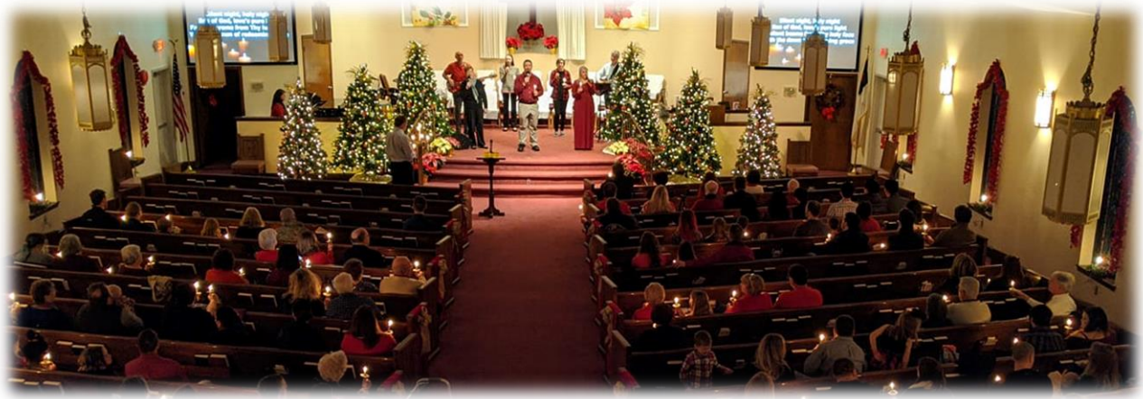
South End Baptist Church – Candle Light Service