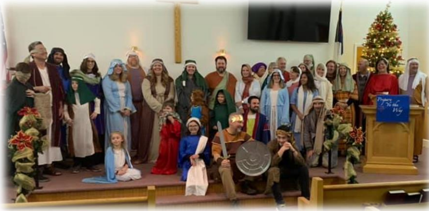
Buck Valley Christian Church – One Starry Night A Savor is Born