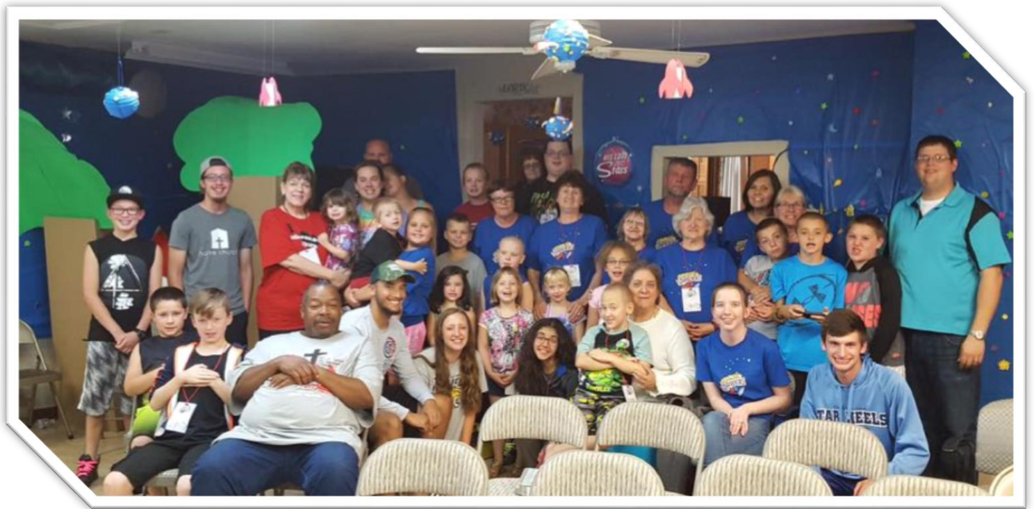
Fellowship Baptist Church of Middletown – Vacation Bible School