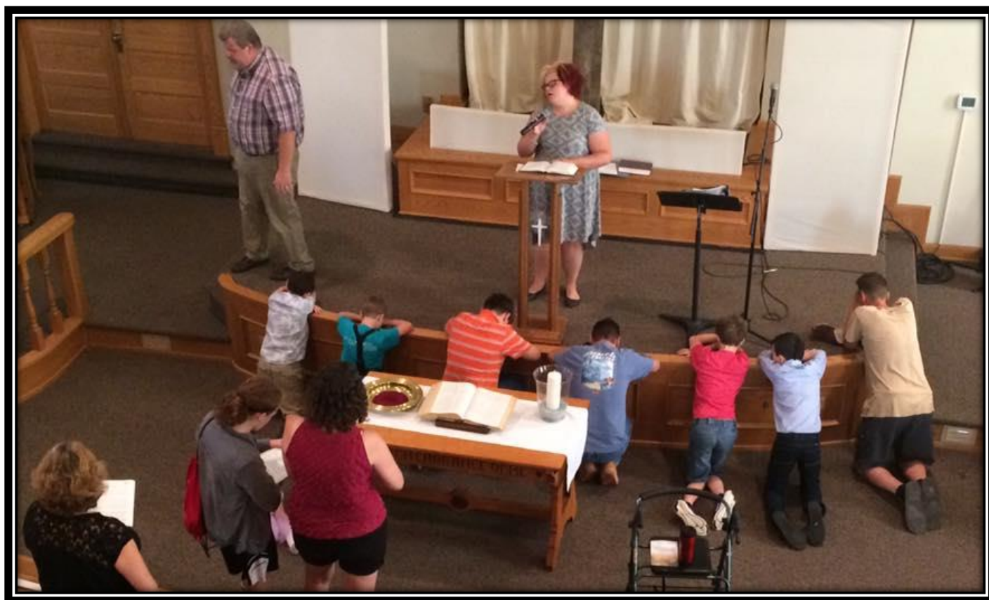
First Baptist Church of Brunswick – young and old on their knees...powerful statement of our God!