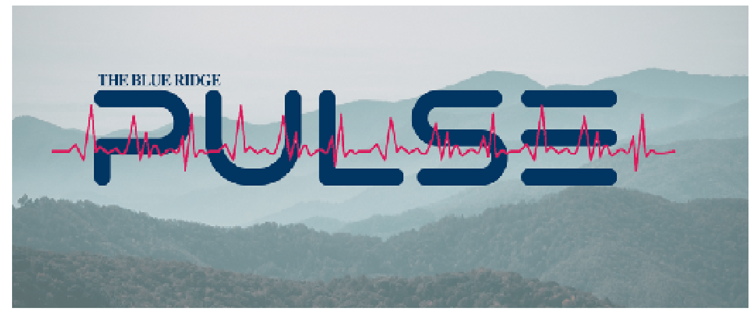
December '22/January 2023